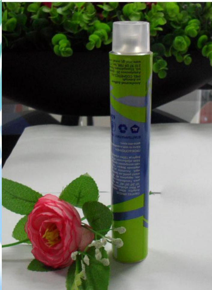
Dia: 28mm tubes