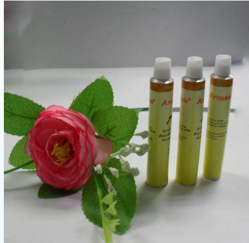
Dia: 13.5mm tubes without long nozzle