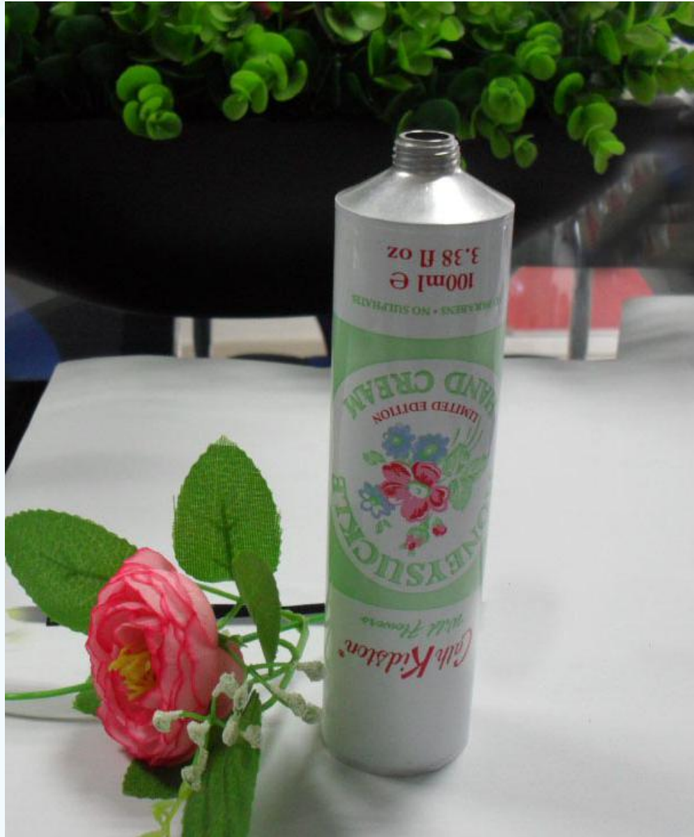
Dia: 40mm tube