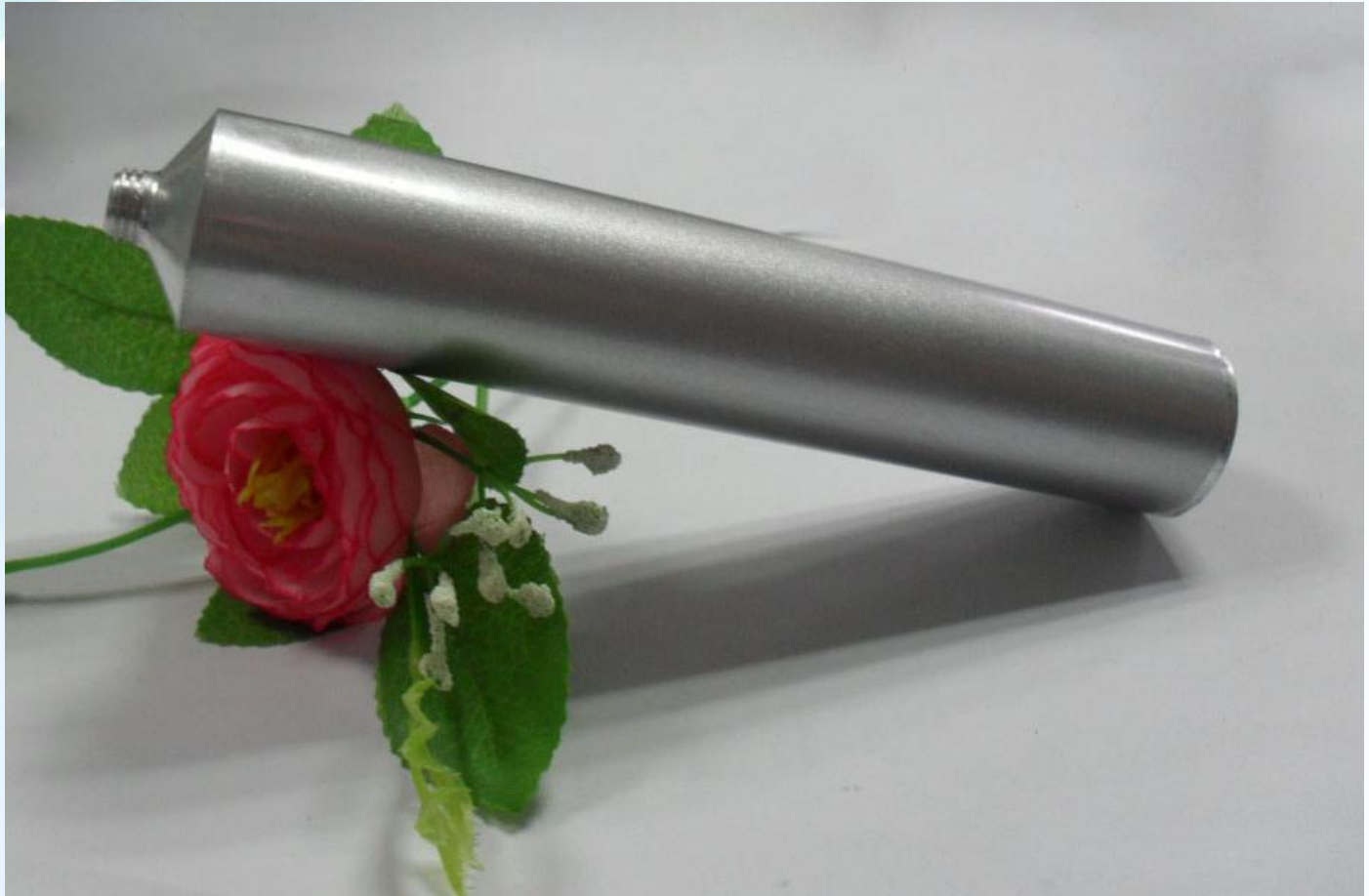
Dia: 32mm tube