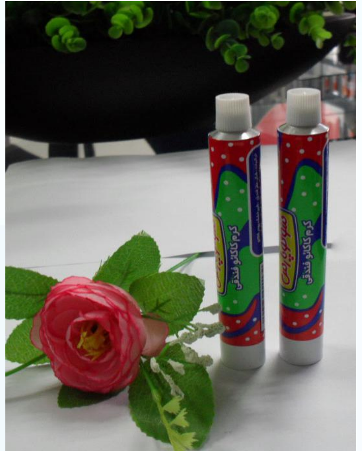
Dia: 19mm tubes