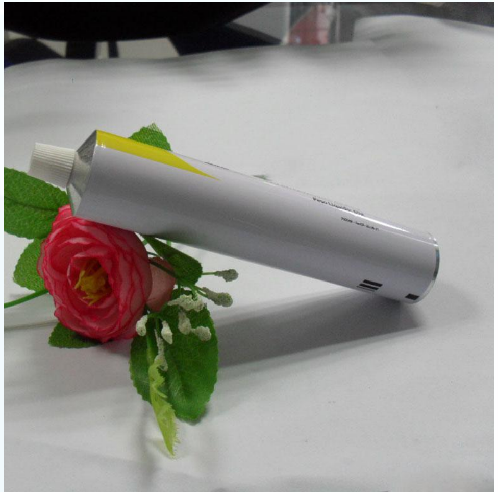
Dia: 30mm tubes