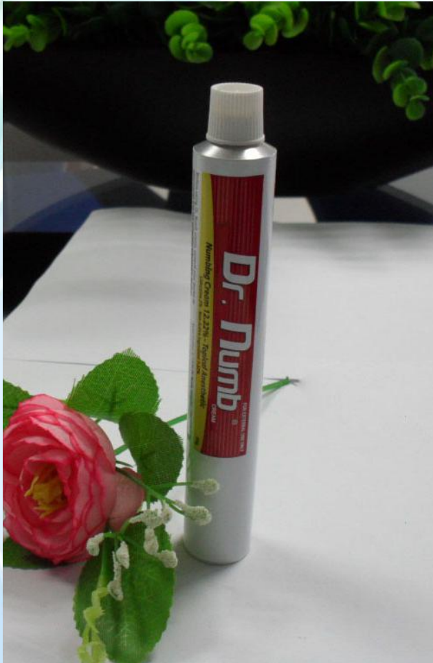
Dia: 22mm tubes