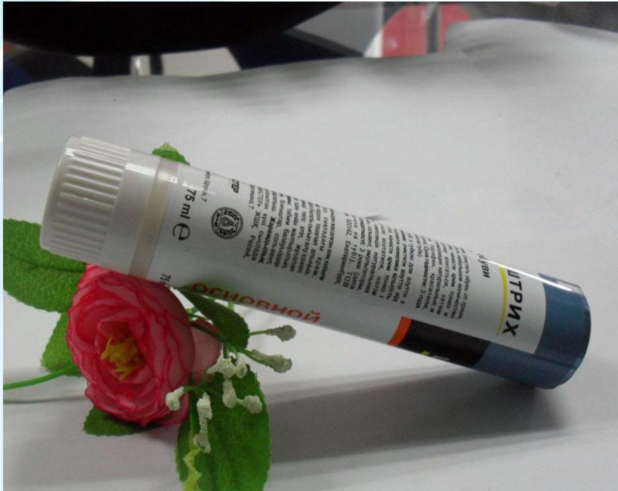
Dia: 35mm tube