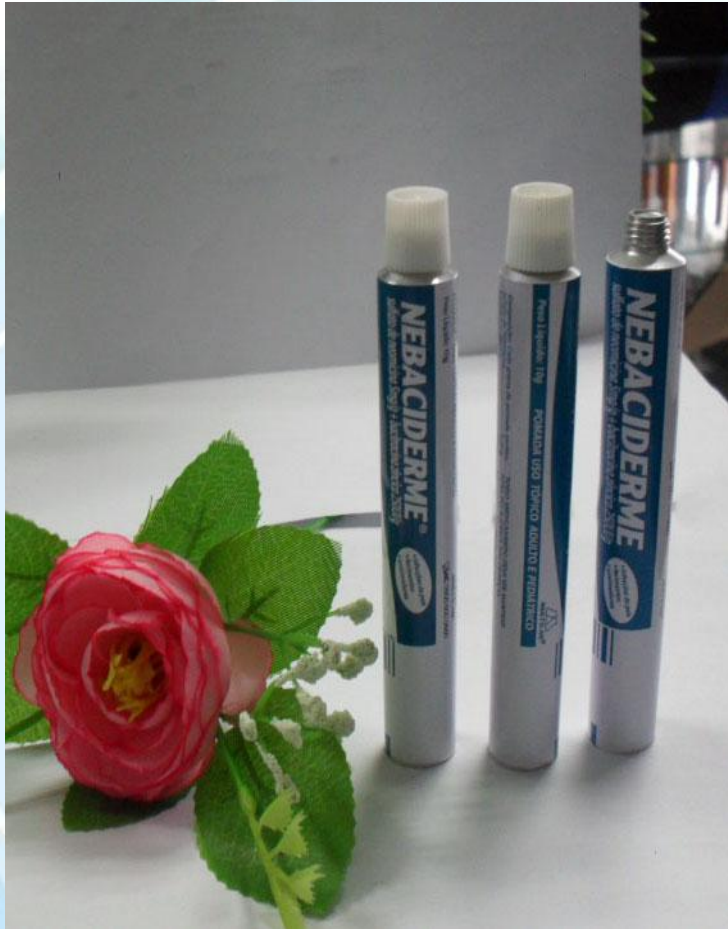
Dia: 16mm tubes