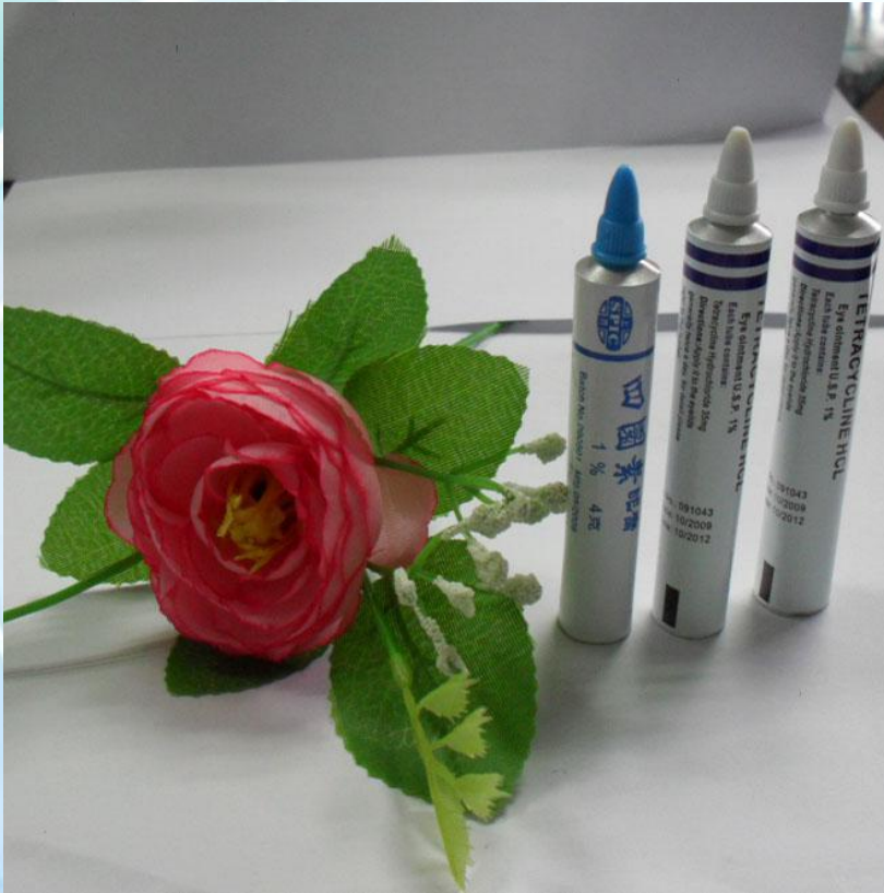
Dia: 13.5mm tubes with long nozzle