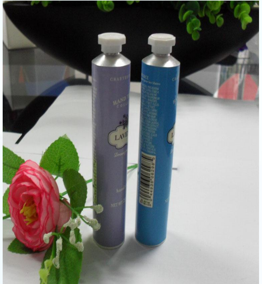
Dia: 25mm tubes