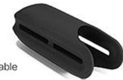
Silicone Sleeve available

SUNMER professional style tools Shanghai Summer Electrical Co.,Ltd. We can provide you first-class products with highest quality and best service.