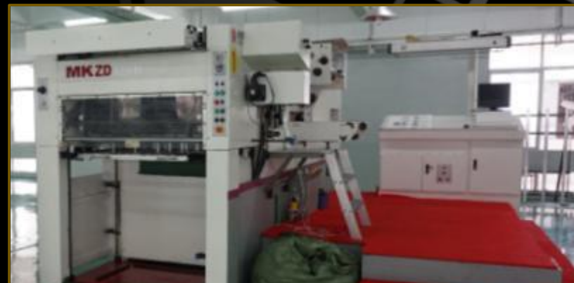
MKZD 920YMI 自动烫金模切机 Automated Foil Stamping / Die Cutting Combination Machine