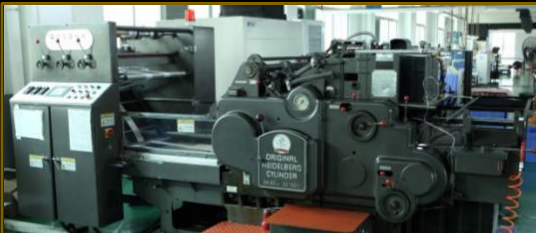
全自动烫金机 Fully automated foil stamping machines