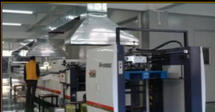
全自动过油机 Fully automated full coating machine