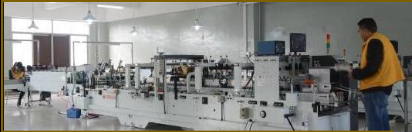
全自动折盒粘盒机 Fully automated folder gluer machines