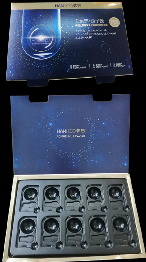
Box+ Plastic holder