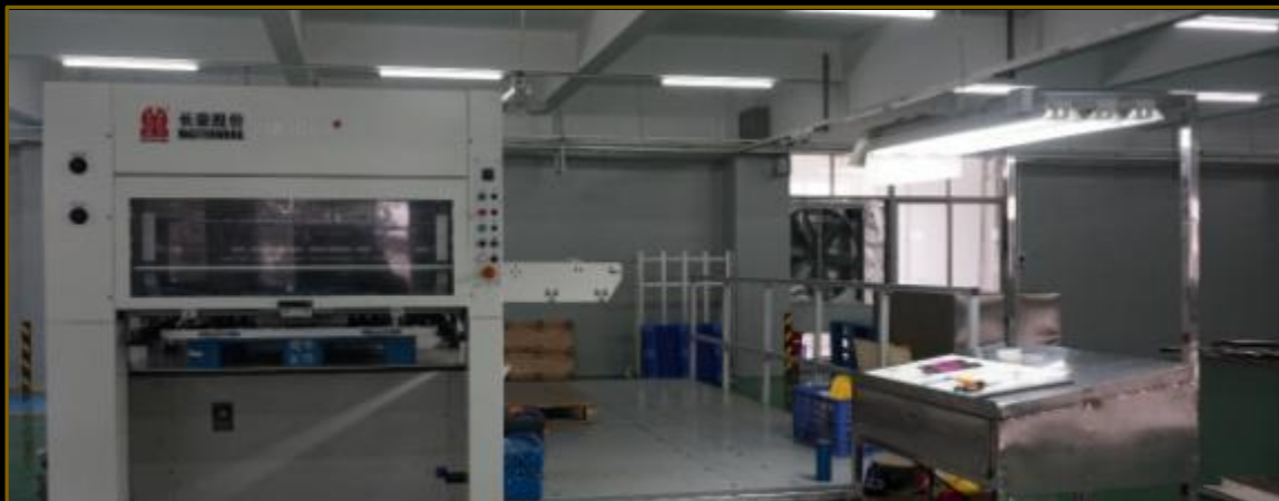
MK 1060 + 自动模切机 Automated Die Cutting Machine