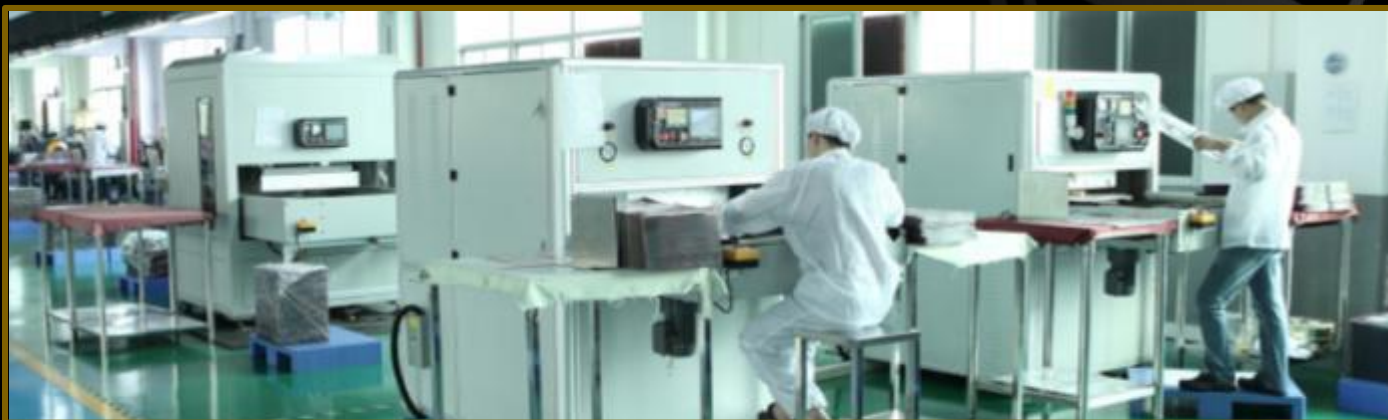
高周波热压 High frequency creasing machine