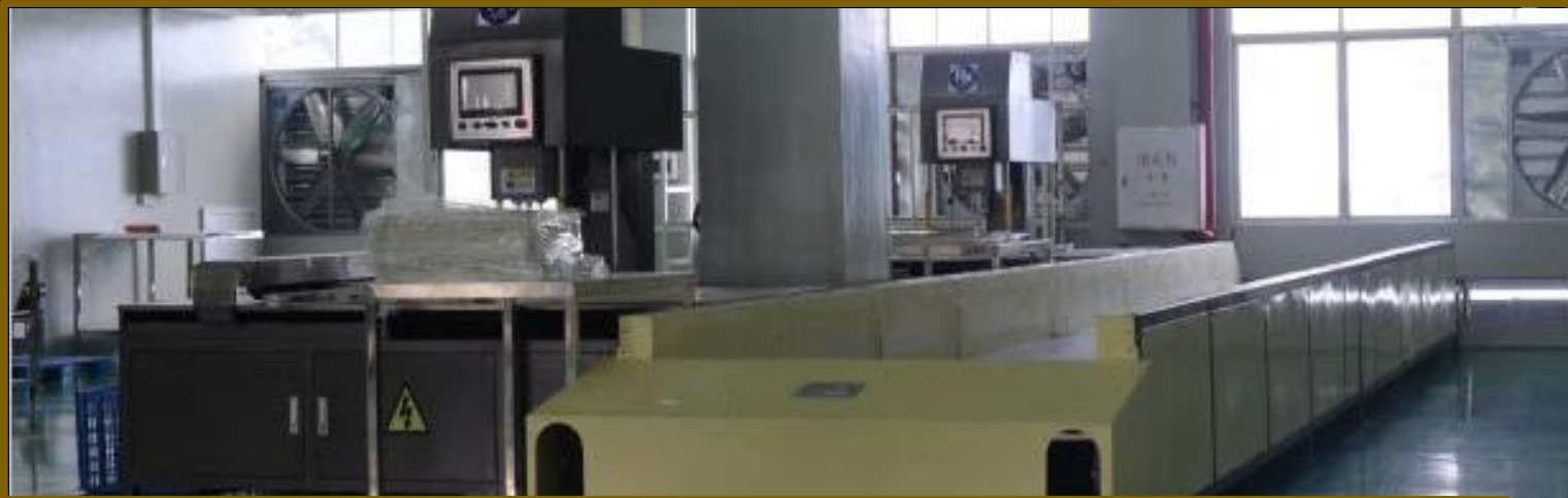
微电脑自动清废机 Automated microcomputer cleaning machine