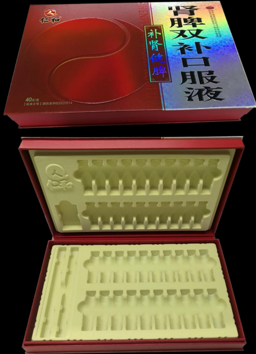
Box+EVA Slut+Magnet Snap