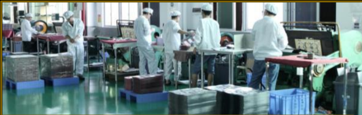
半自动模切机 Semi-automated die cutting machines