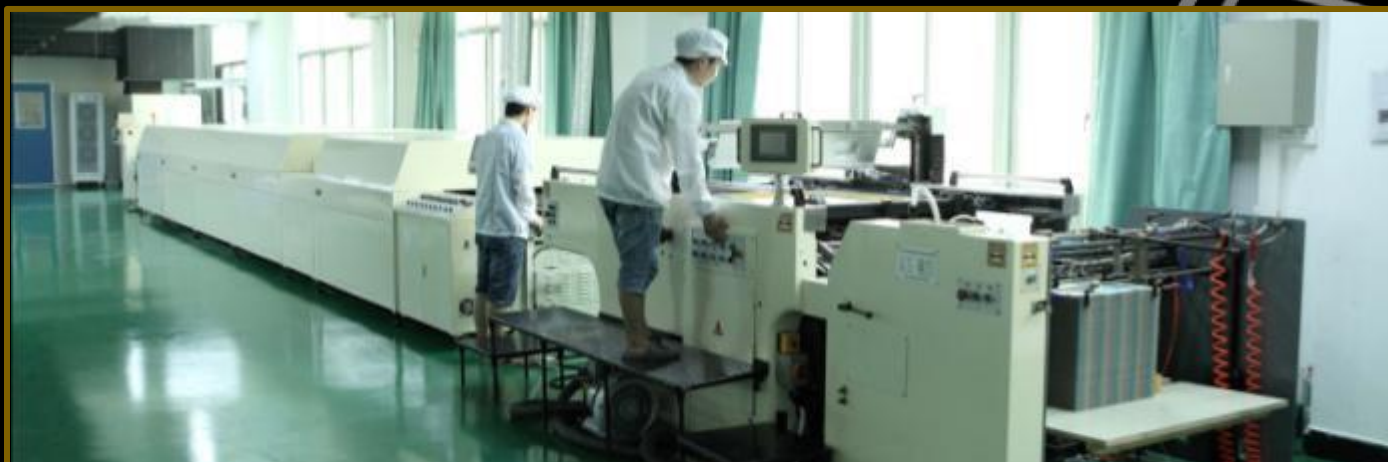
全自动丝印机 Fully automated silk screen printing machine