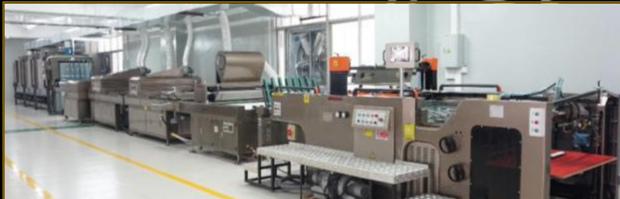
全自动丝印机 Fully automated silk screen printing machine