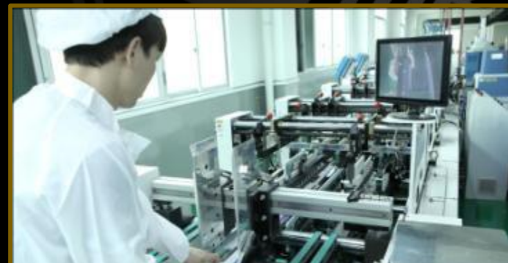
全自动折盒粘盒机 Fully automated folder gluer machines