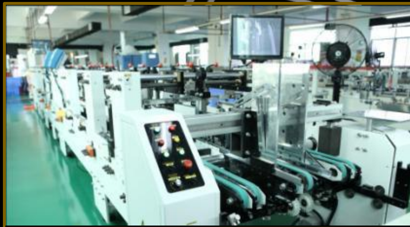
全自动折盒粘盒机 Fully automated folder gluer machines