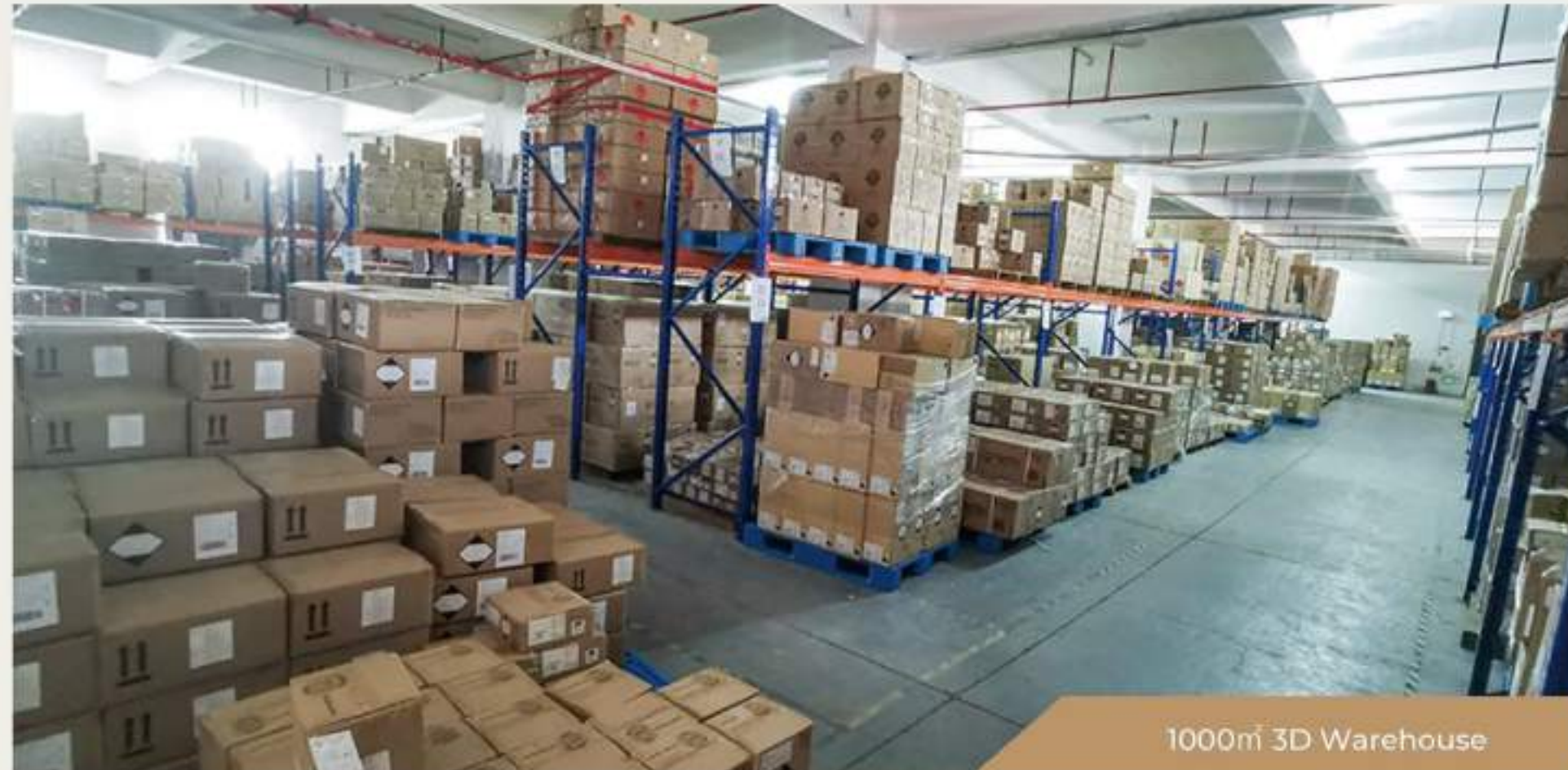
1000m³ 3D Warehouse