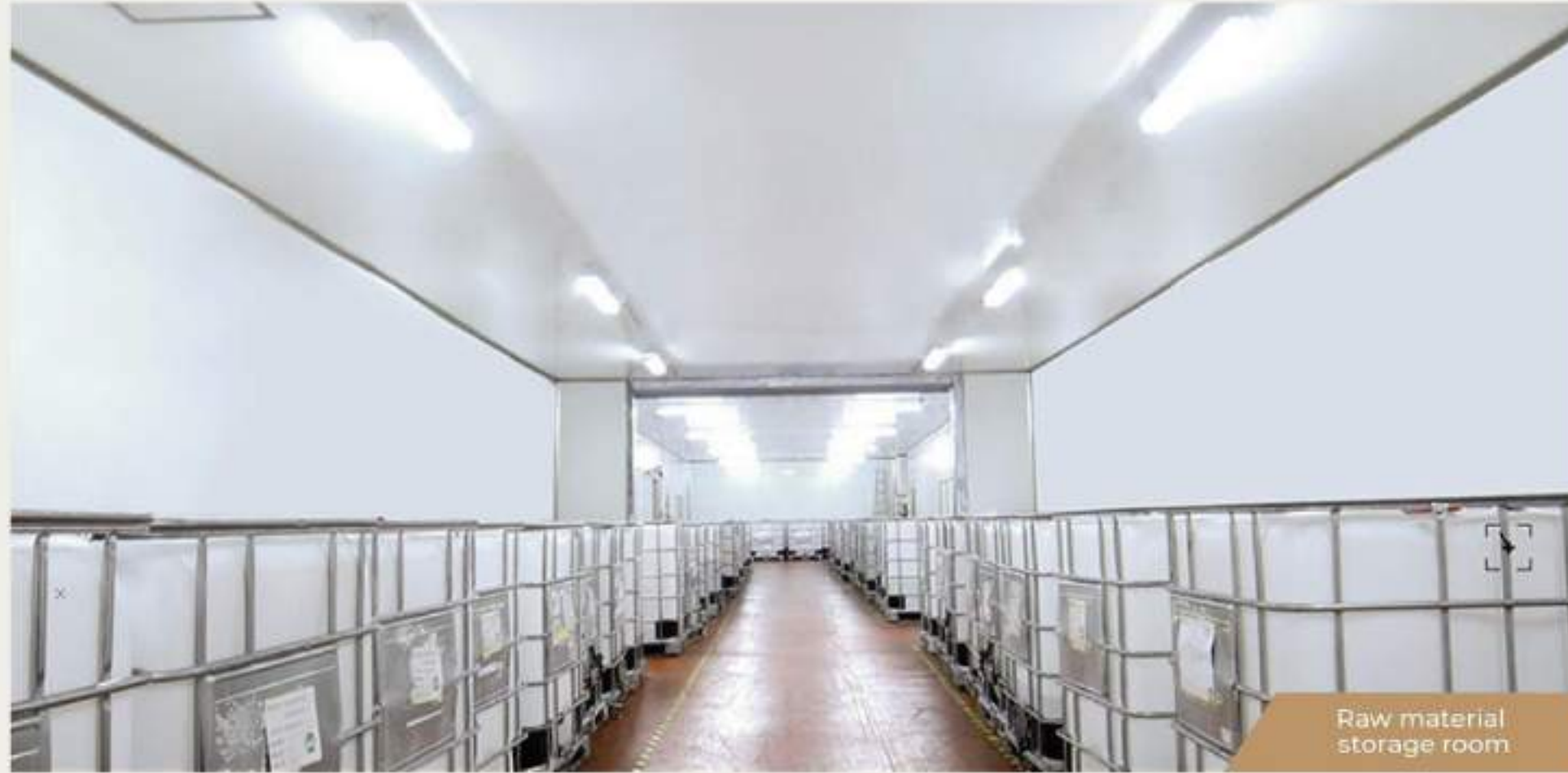
Raw material storage room