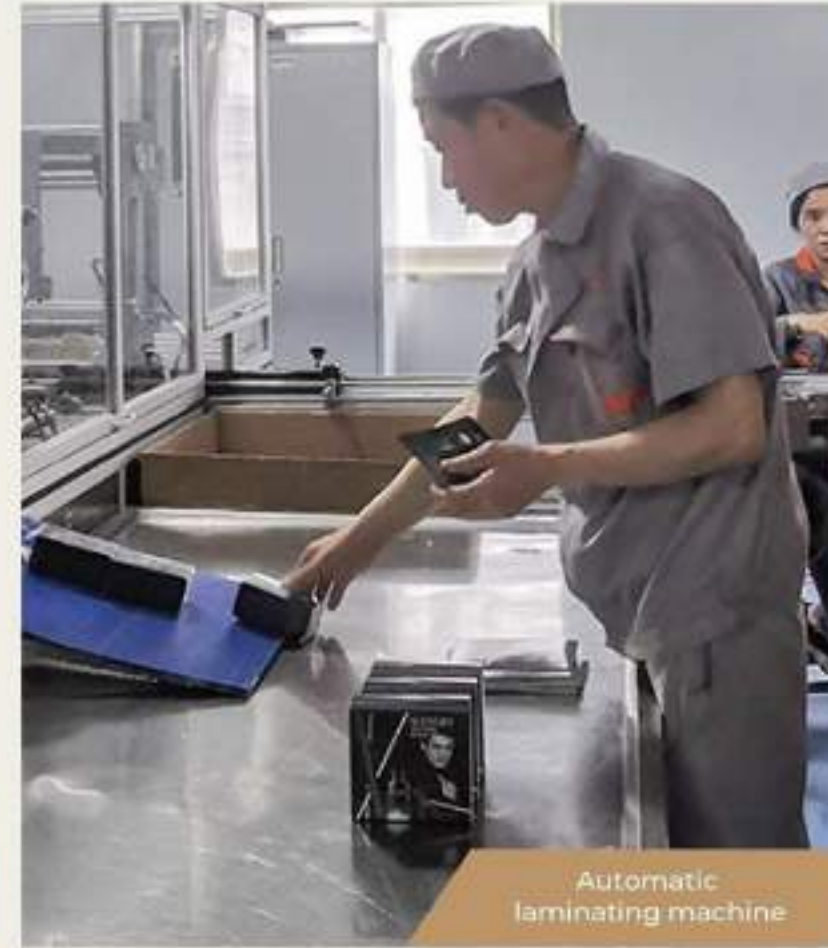
Automatic laminating machine