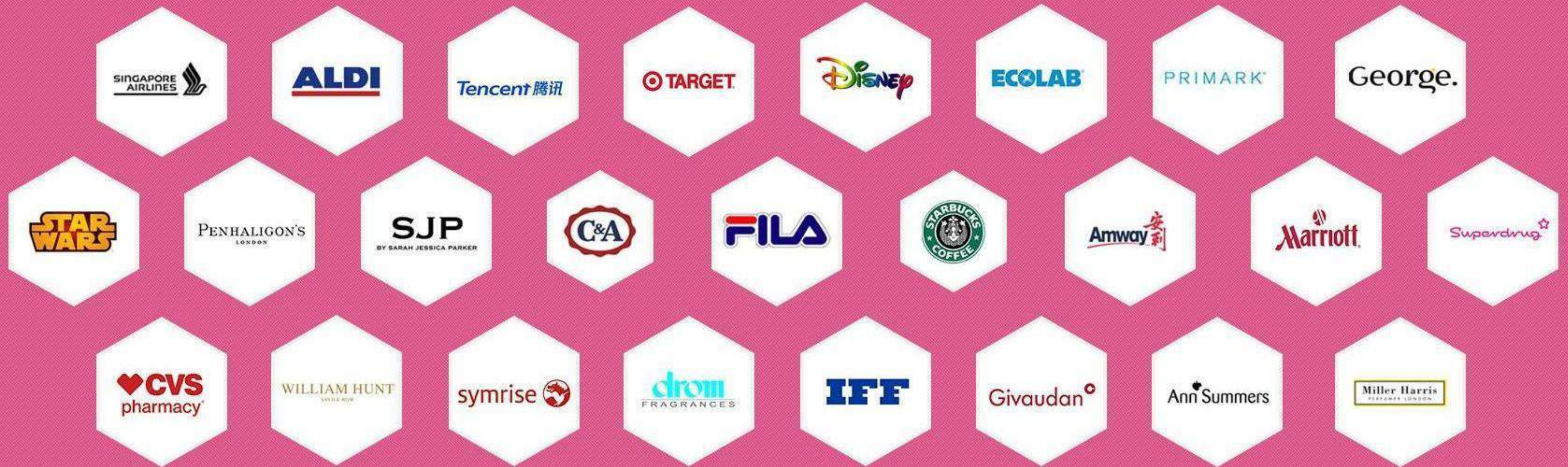
Jinghui Global Partners

PRIMARK, ALDI, Target, Kmart, C&A, FILA, etc.