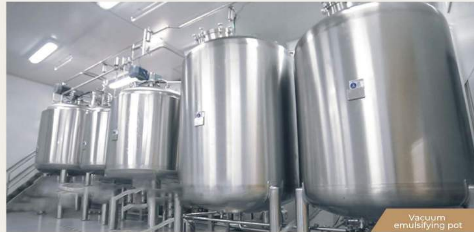
Vacuum emulsifying pot