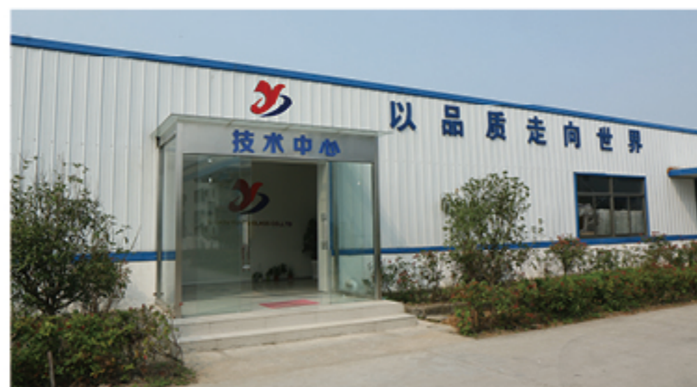
Specialists in glass bottle manufacturing