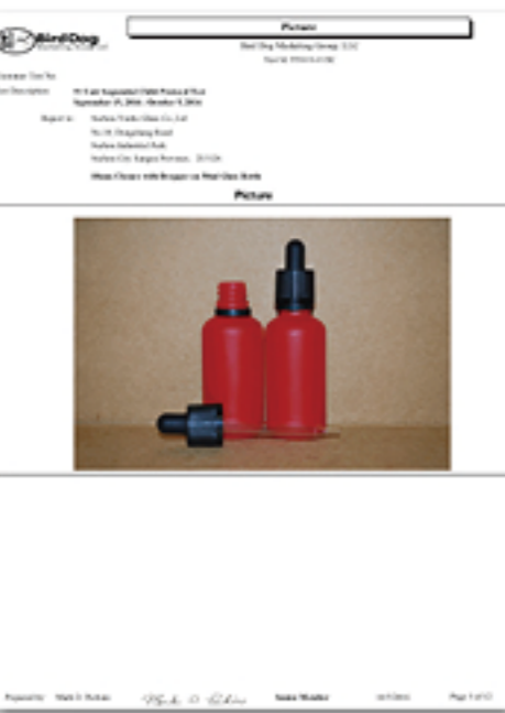
CFR part 1700.15 and 1700.20.