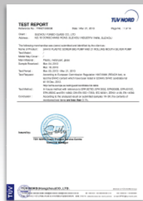
TUV NORD TEST