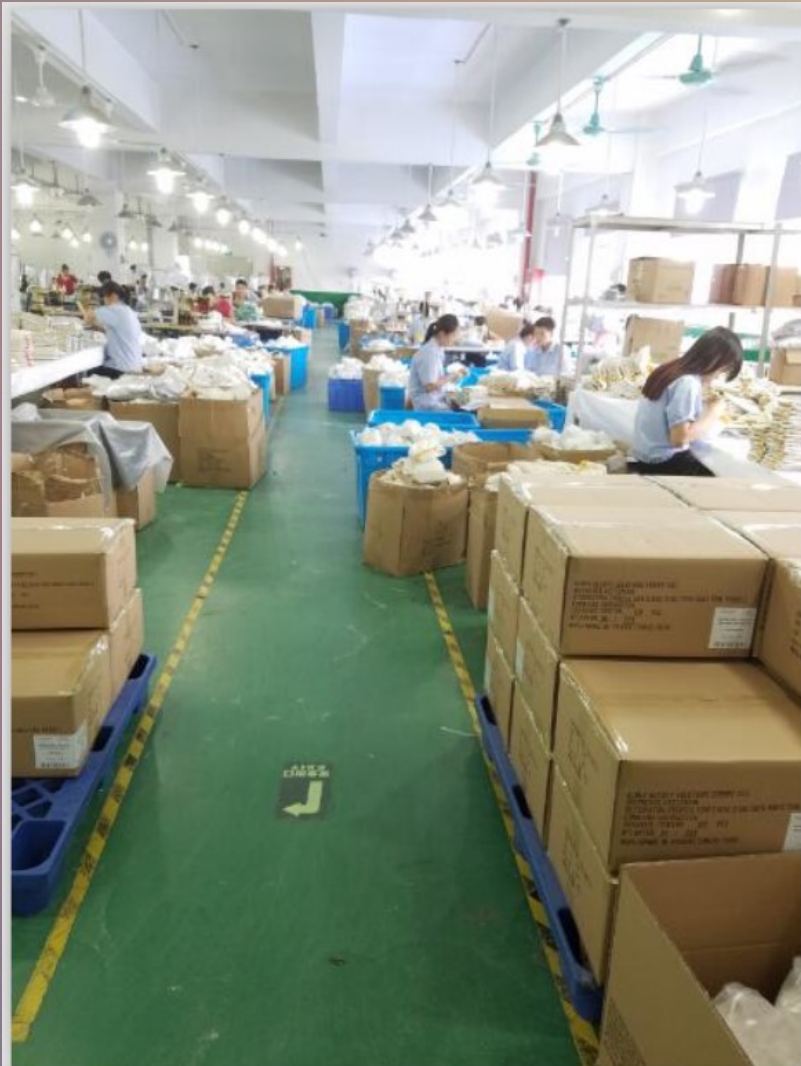
Stitching Dept 01