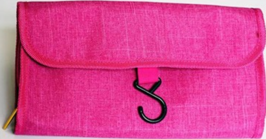
JF16-001a 24(L)*5(W)*13(H) CM