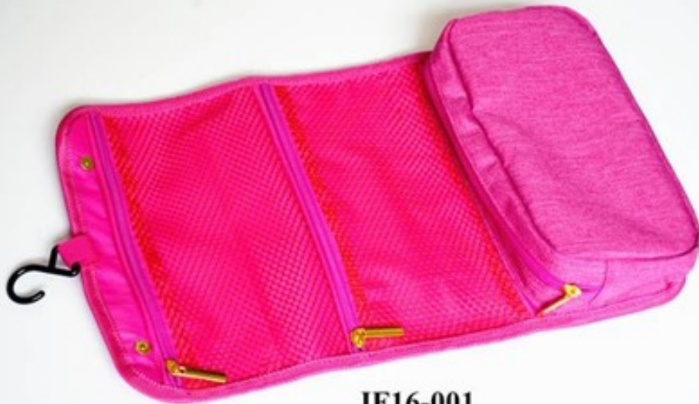
JF16-001 24(W)*37(L) CM