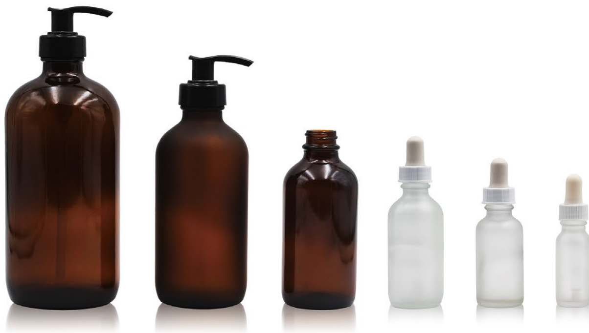
Boston Round Bottles 波士顿瓶系