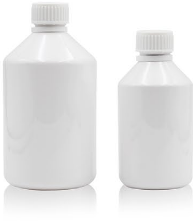
Sloping Shoulder Bottles 斜肩瓶