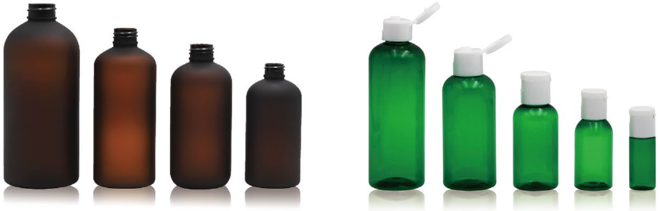
Round Shoulder Bottles 圆肩瓶