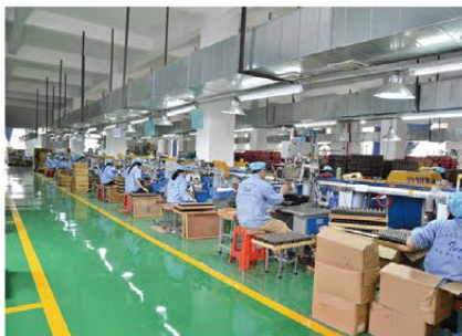
Printing Division 印刷车间