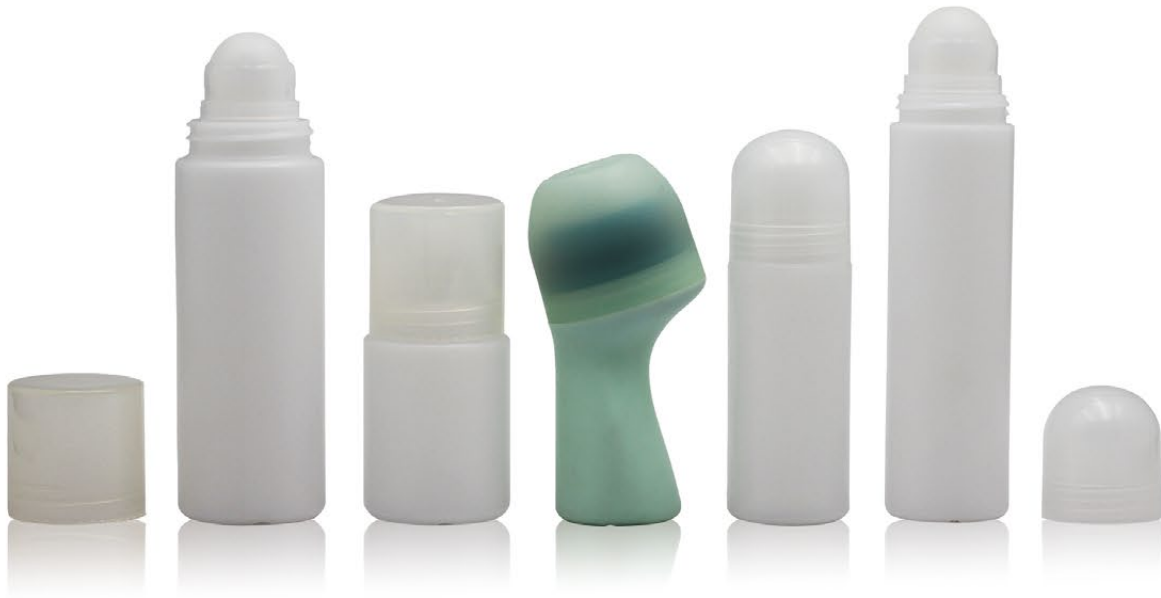
PE Roll-on Bottles PE 滚珠瓶