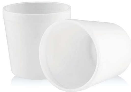
PE Measuring Cups 量杯