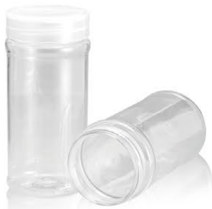
Salt Shaker Jar 调料罐