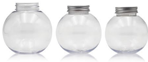
Ball-shaped Bottles 球形瓶