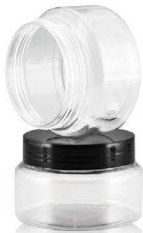
Other Shapes 其他