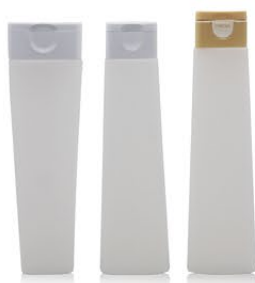
Triangle Bottles 三角瓶