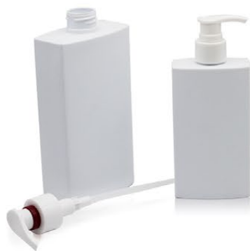
Square Bottles 方瓶