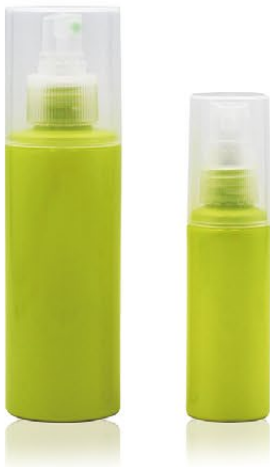
PET Spray Bottles PET 喷雾瓶