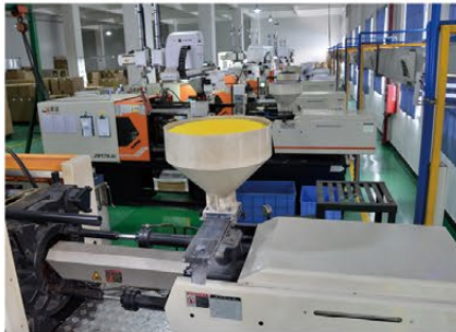
Injection Molding Division 注塑车间