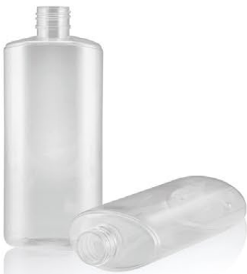
Flat Bottles with Flip-top Cap 扁瓶配翻盖