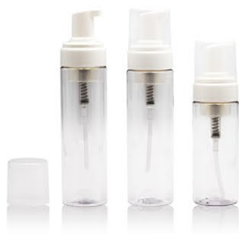
Foam Pump Bottles 泡沫泵瓶