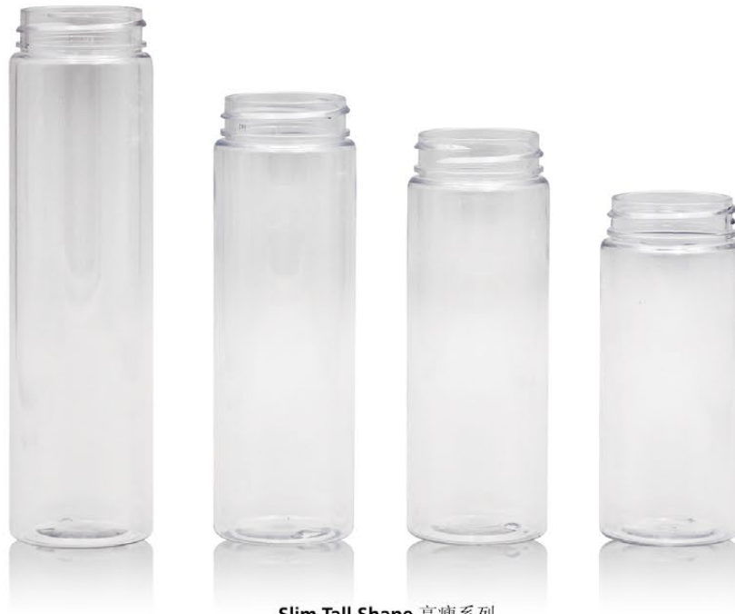
Slim Tall Shape 高瘦系列