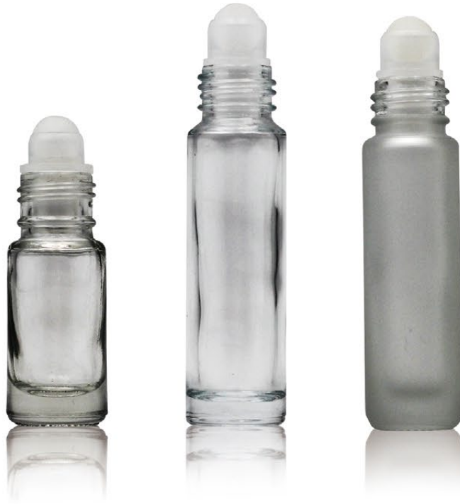
Glass Roller Bottles 玻璃滚珠瓶