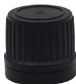
Tamper-evident Cap 防盗盖