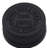
Child-Resistant Cap 安全盖