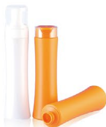
Foam Pump Bottles 泡沫泵瓶