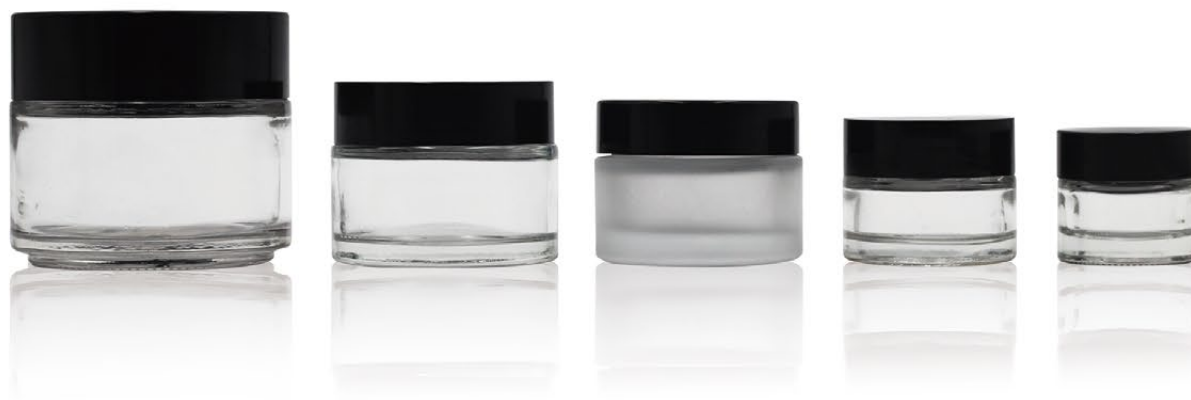
Glass Jars 玻璃膏霜罐系列