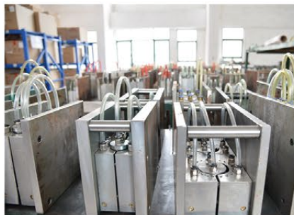
Mold Division 模具车间