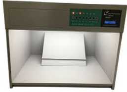
Color Assessment Cabinet 对色箱