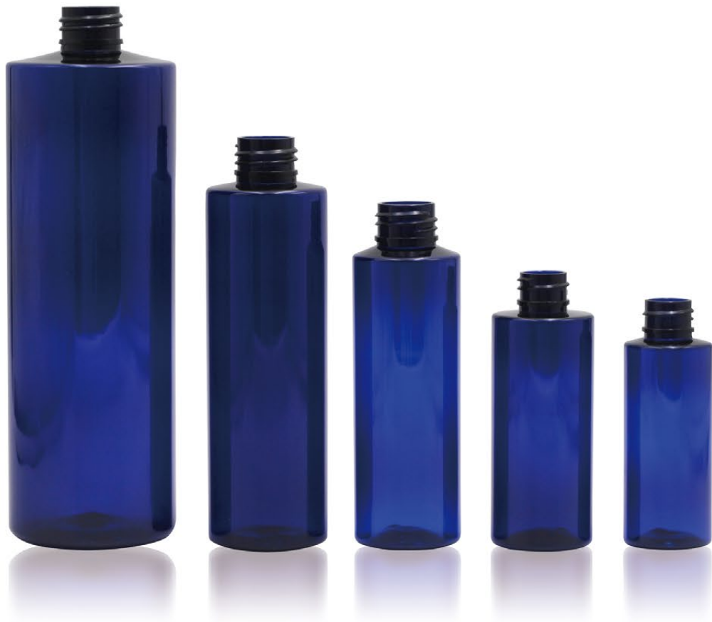
Cylinder Bottles 平肩瓶