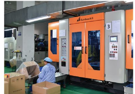
PE Blowing Division PE 吹瓶车间