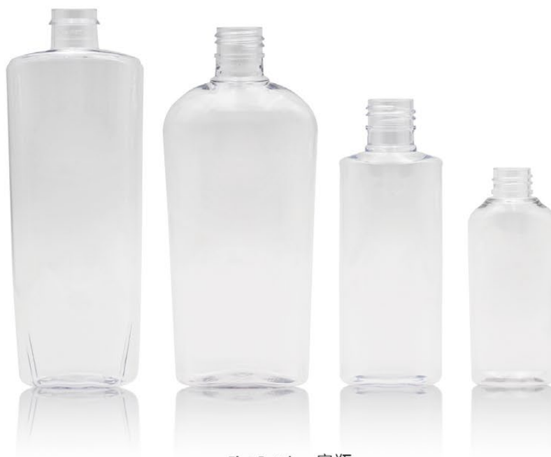
Flat Bottles 扁瓶