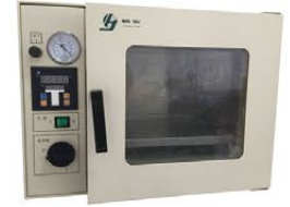
Vacuum Leak Tester 真空密封测试仪