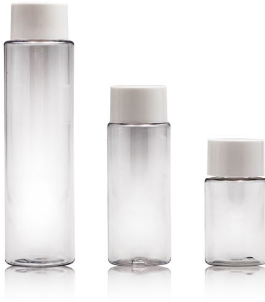
Cylinder Bottles with Reducer and Double Wall Screw Cap 平肩瓶配内塞和双层旋盖