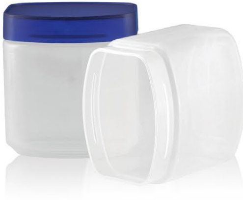
Retangular Jars 方形罐