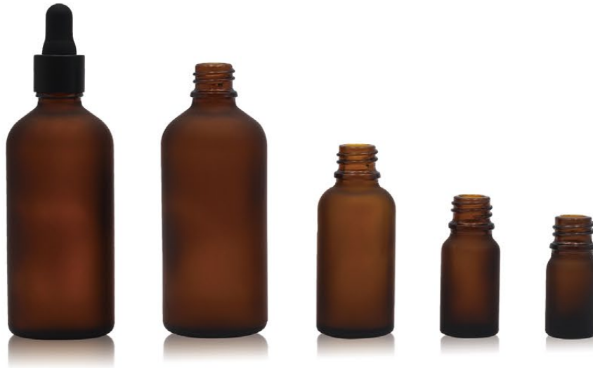
Essential Oil Bottles 精油瓶系列