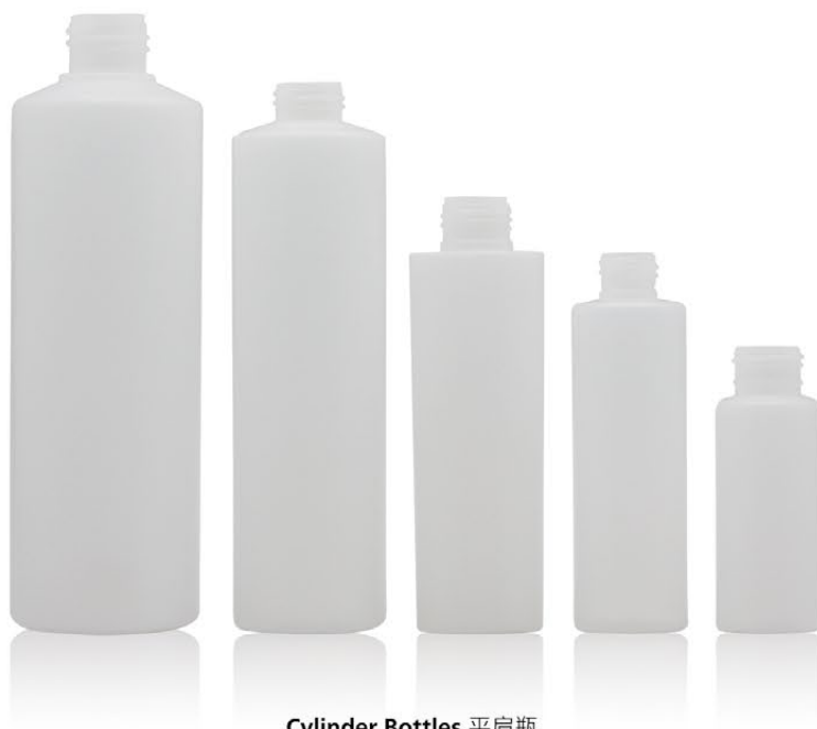
Cylinder Bottles 平肩瓶