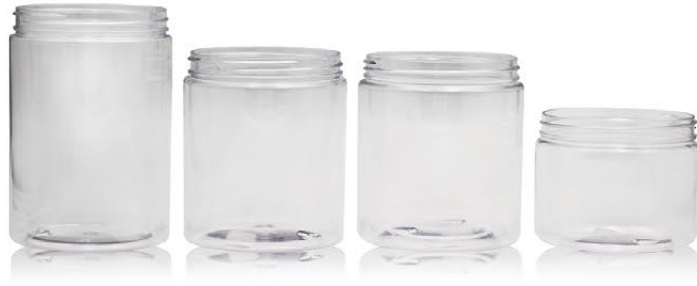
Low Profile Shape 矮胖系列