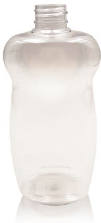
Baby Oil Bottles 婴儿油瓶