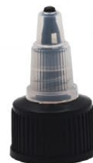
Twist Top Cap 尖嘴盖