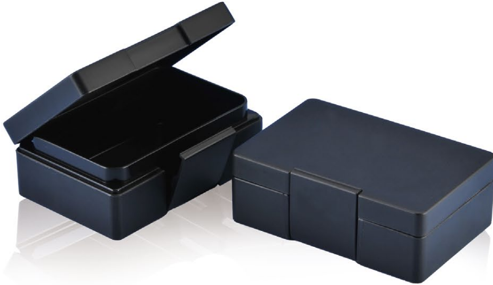
PP Containers 方盒