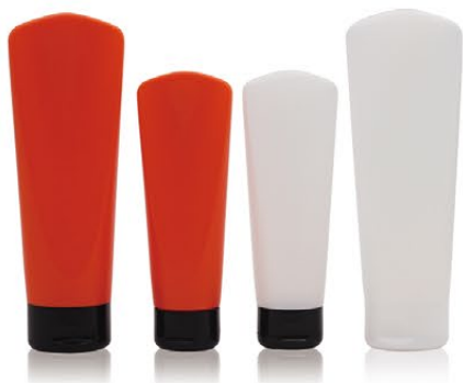
Tottle Bottles 倒立瓶