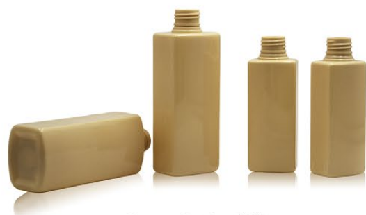
Square Bottles 方瓶