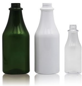
Olive Oil Bottles 橄榄油瓶