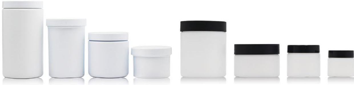
PE Jar PE 罐