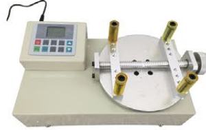
Torque Gauge 扭力仪