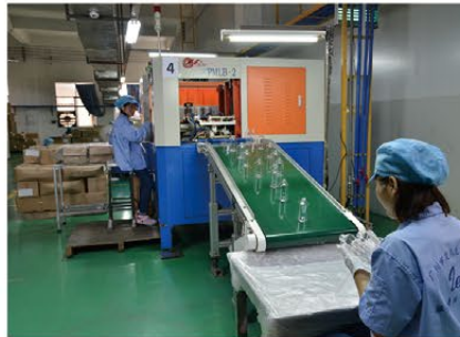
PET Blowing Division PET 吹瓶车间