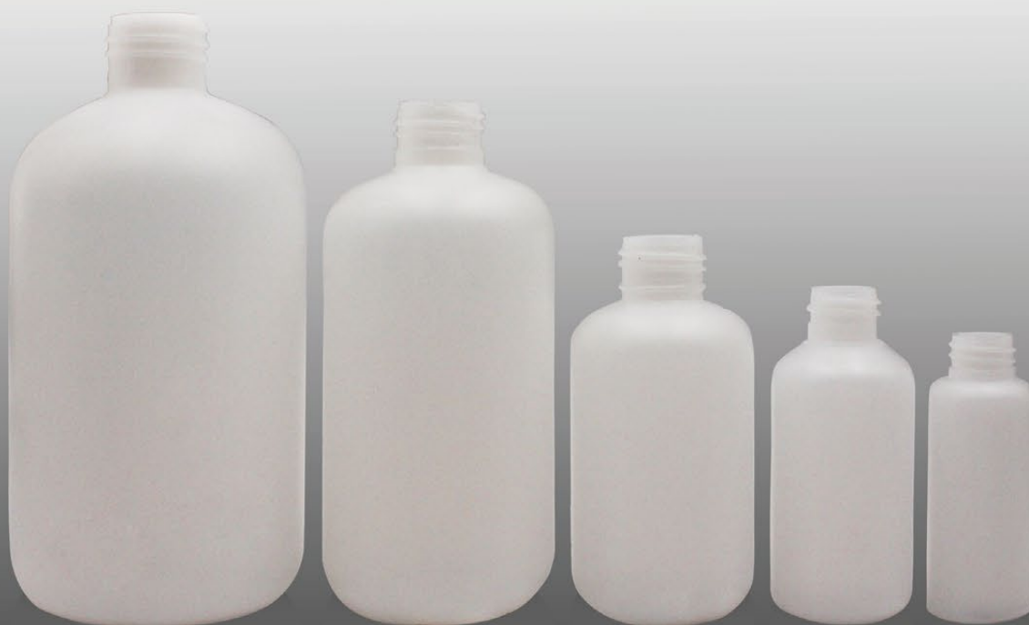
Round Shoulder Bottles 圆肩瓶