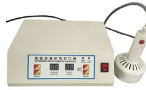
Heat Seal Tester 热封测试仪