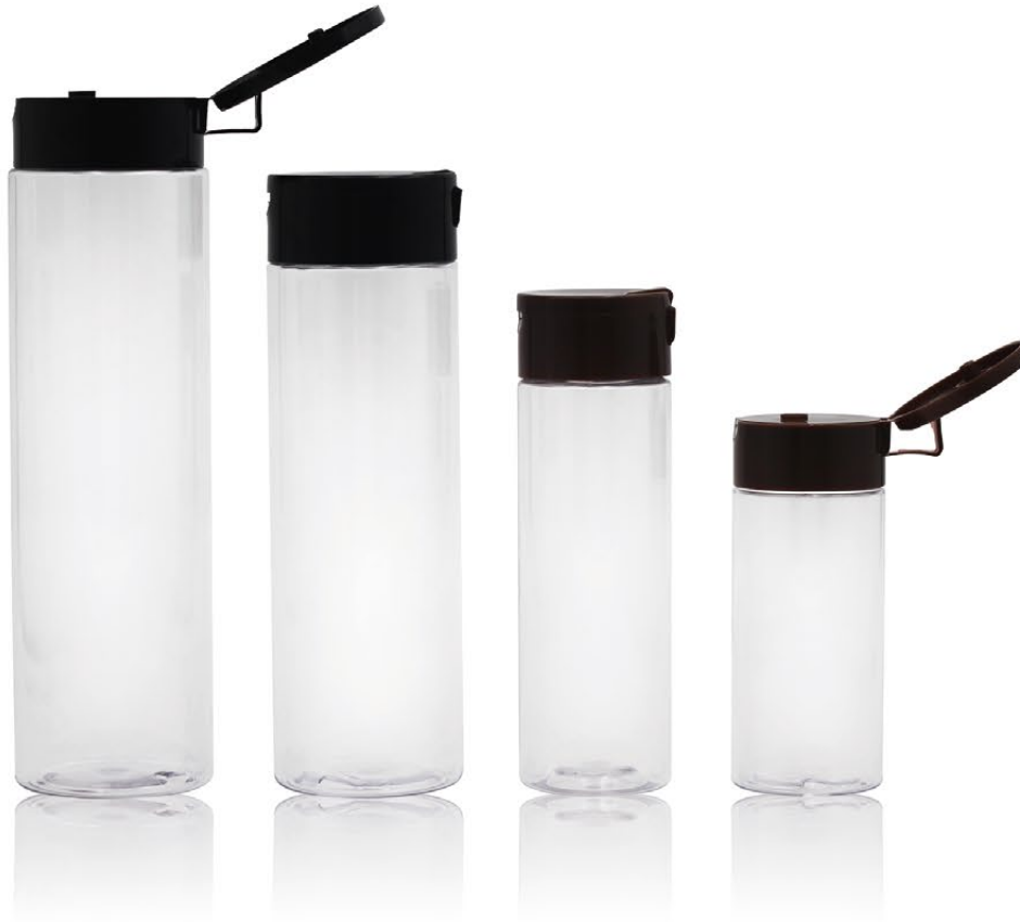
Cylinder Bottles with Flush Flip-top Cap 平肩瓶配大翻盖