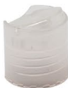
Disc Top Cap 千秋盖