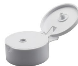
Flip-Top Cap 翻盖