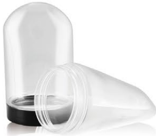
Tottle Jar 倒立罐