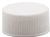
Screw Cap 旋盖