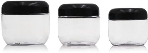
Dome Shape 圆顶罐