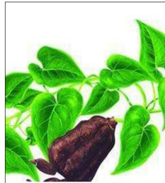
polygonum multiflorum root extract