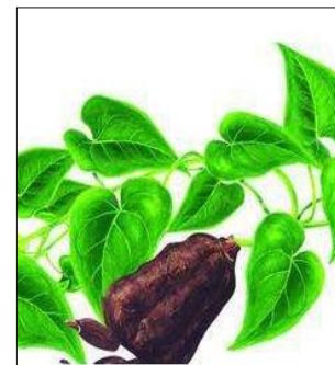
polygomon multiflorum root extract