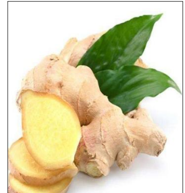
ginger root extract