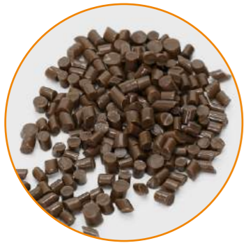
Brown Color Italian Keratin Beads