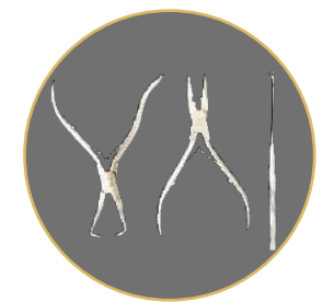
Stainless Plier Set