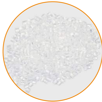
Clear Color Italian Keratin Beads