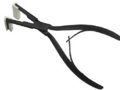
Tape Hair Plier

4cm*0.6cm*20 strips 4cm*1cm*20 strips 4cm*0.8cm*20 strips