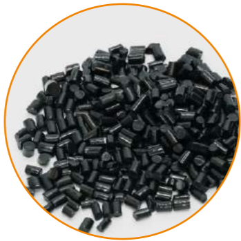
Black Color Italian Keratin Beads