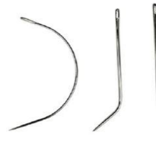
I J C Needle