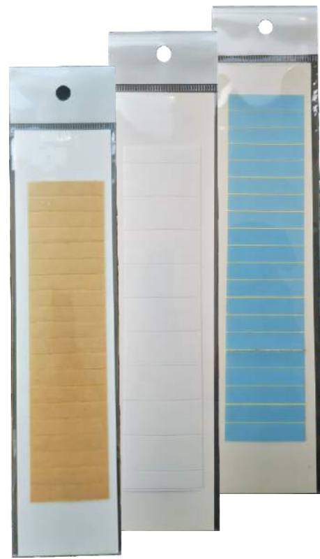
Replacement Tape Sheets

1"* 36 Yard 3/4"* 36 yard 1cm*36 yard 0.8cm*36yard 0.8cm*12yard 0.8cm*3yard