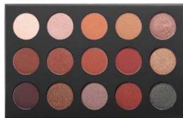
PL - 011