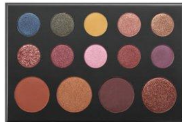
PL - 010