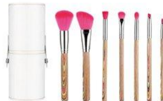
Item No: BR - SET - 001 Bristle: Synthetic hair Ferrule: Aluminum Handle: Wood