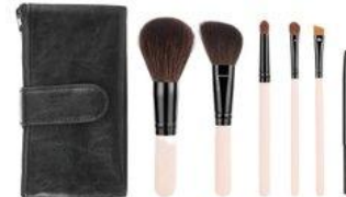
Item No: BR - SET - 011

Bristle: Goat hair, Synthetic hair, Pony hair