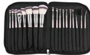
Item No: BR - SET - 017