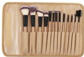
Item No: BR - SET - 015