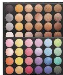
PL - 004