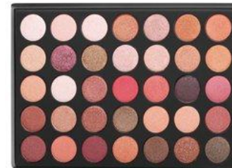
PL - 014