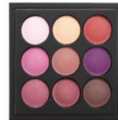
PL - 008