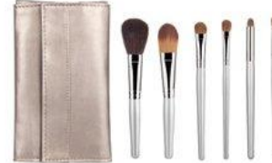
Item No: BR - SET - 009

Bristle: Goat hair, Pony hair, Synthetic hair