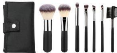
Item No: BR - SET - 007