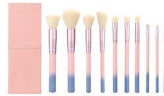
Item No: BR - SET - 002 Bristle: Synthetic hair Ferrule: Aluminum Handle: Wood