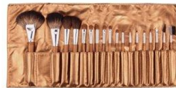
Item No: BR - SET - 019

Bristle: Goat hair, Pony hair, Synthetic hair, Raccoon hair