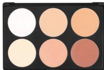
PL - 003