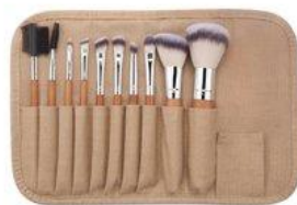
Item No: BR - SET - 016