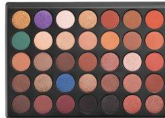
PL - 013