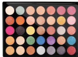
PL - 012