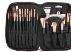
Item No: BR - SET - 018

Bristle: Goat hair, Pony hair, Synthetic hair