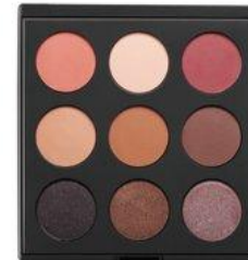
PL - 006