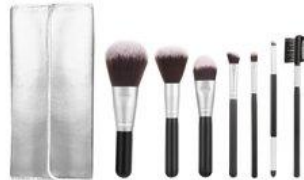
Item No: BR - SET - 008