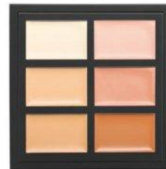
PL - 005