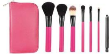
Item No: BR - SET - 005