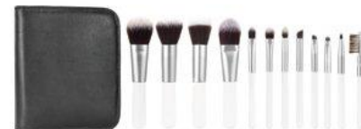
Item No: BR - SET - 004 Bristle: Synthetic hair Ferrule: Aluminum Handle: Wood