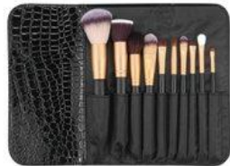
Item No: BR - SET - 014

Bristle: Goat hair, Pony hair, Synthetic hair