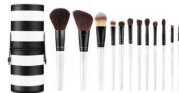
Item No: BR - SET - 003 Bristle: Goat hair, Pony hair, Synthetic hair Ferrule: Aluminum Handle: Wood