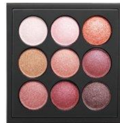
PL - 007