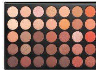
PL - 016