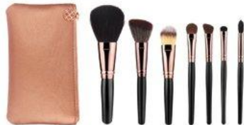
Item No: BR - SET - 013

Bristle: Goat hair, Pony hair, Synthetic hair