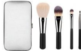
Item No: BR - SET - 006