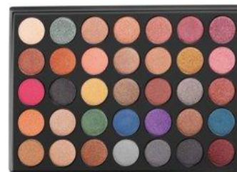
PL - 015