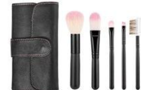
Item No: BR - SET - 012