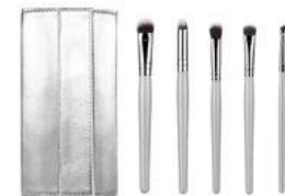
Item No: BR - SET - 010