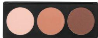
PL - 001