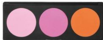
PL - 002