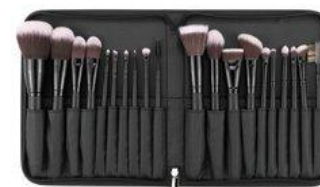
Item No: BR - SET - 020