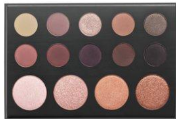
PL - 009