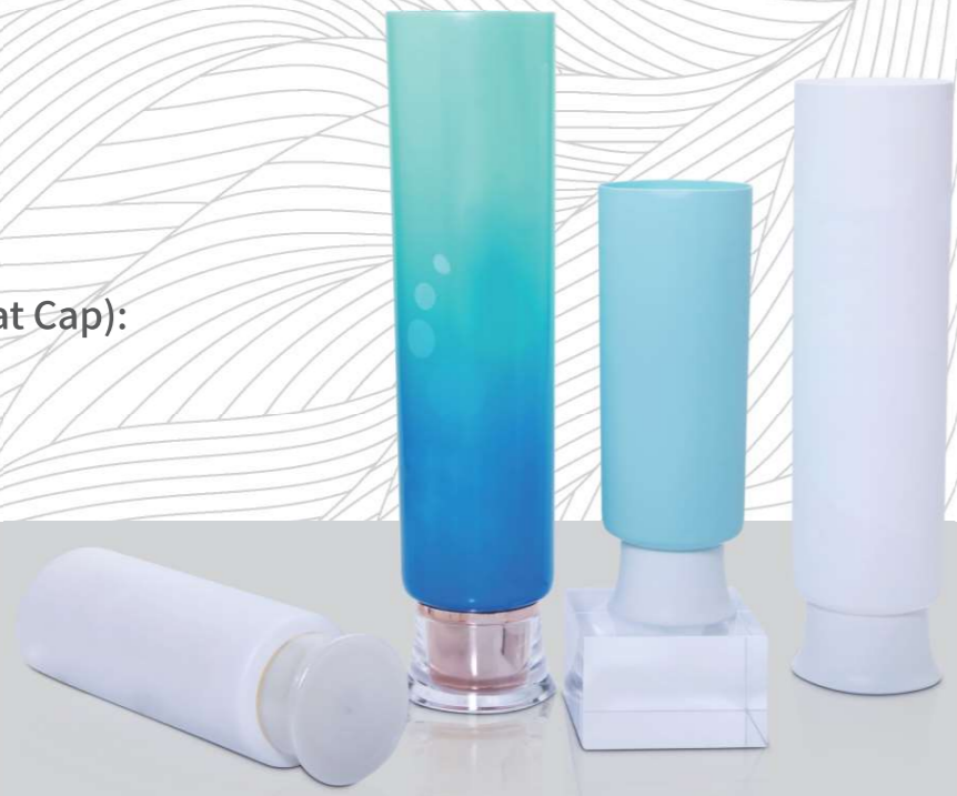
Round Tube (Doctoral Hat Cap): Φ50/45/40