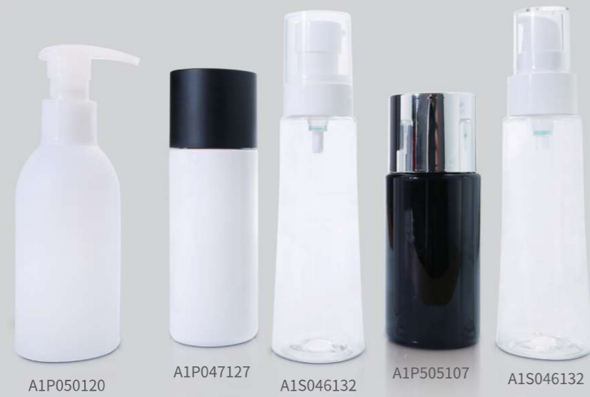
A1P050120 A1P047127 A1S046132 A1P505107 A1S046132