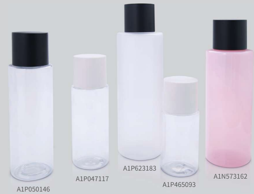
A1P050146 A1P047117 A1P623183 A1P465093 A1N573162