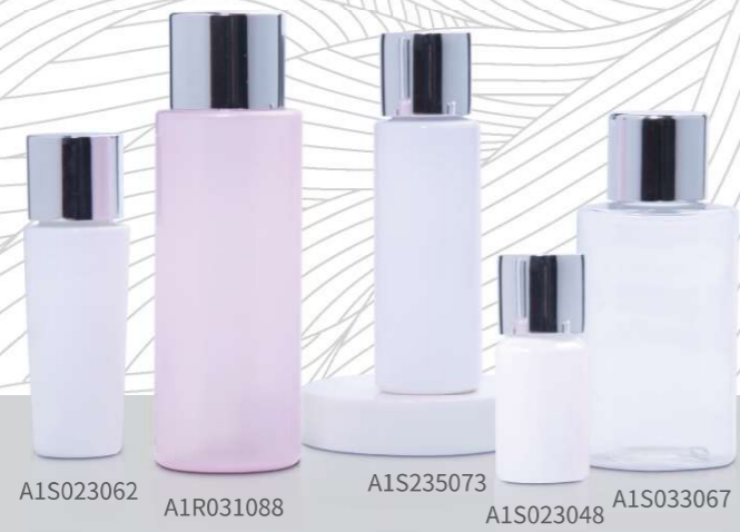
A1S023062 A1R031088 A1S235073 A1S023048 A1S033067