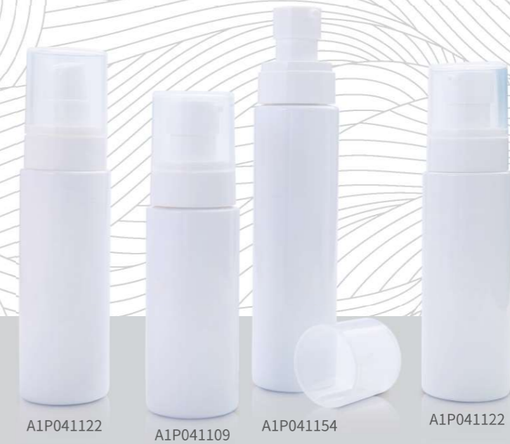
A1P041122 A1P041109 A1P041154 A1P041122