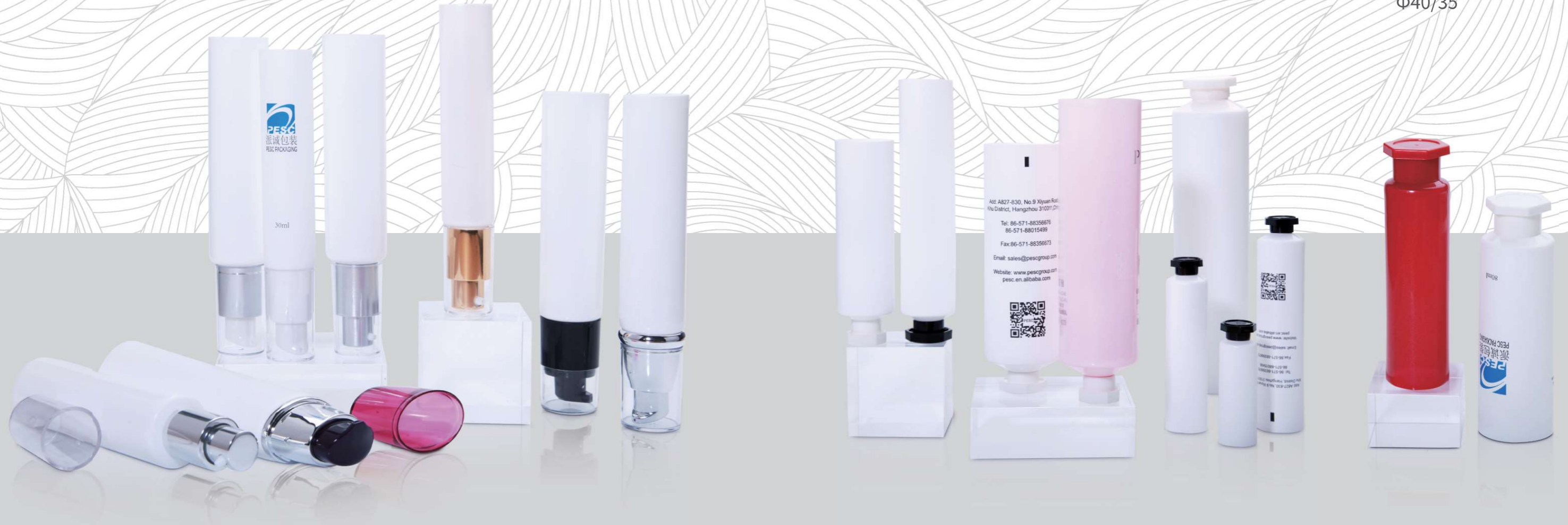
Round Tube (Hexagonal Cap): Φ40/35