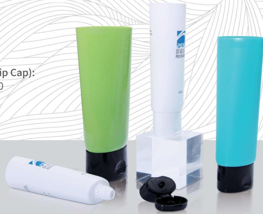
Oval Tube(Flip Cap): Φ50/40/35/30