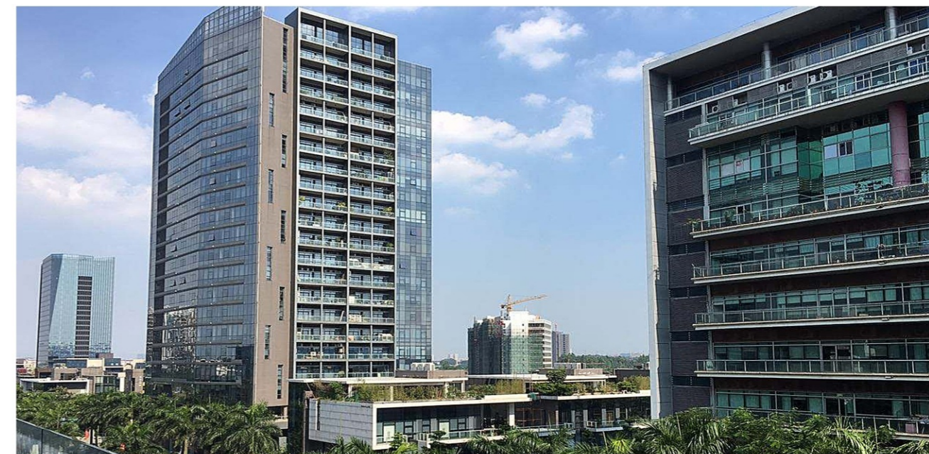
广州公司 Guangzhou office