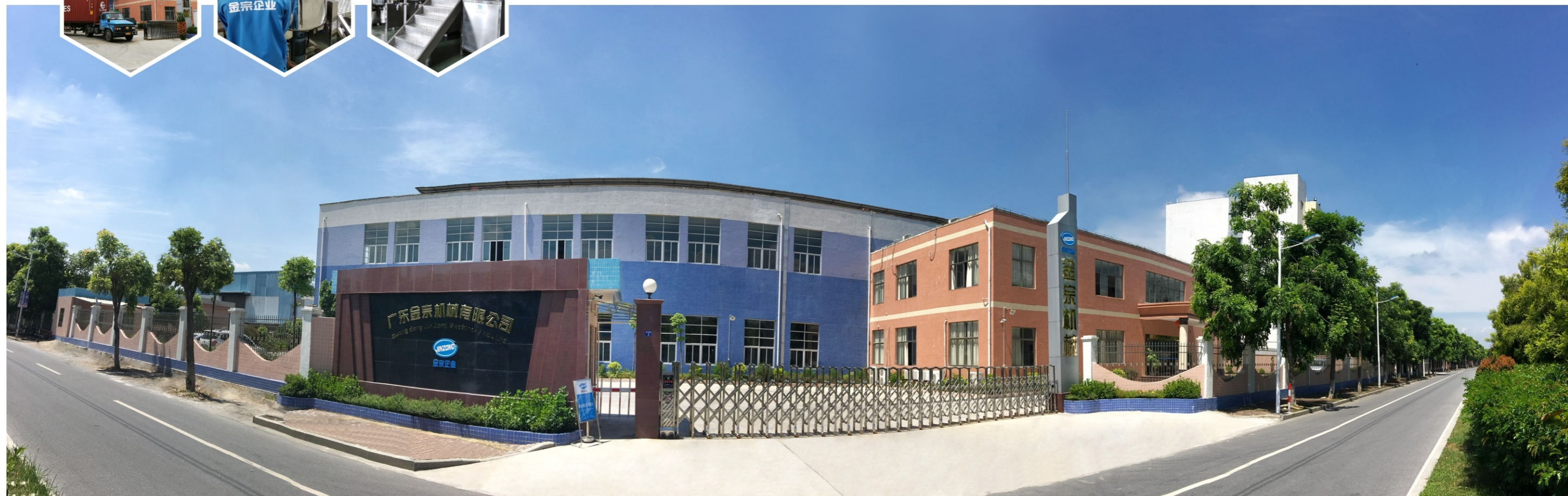
肇庆工厂 Factory in Zhaoqing