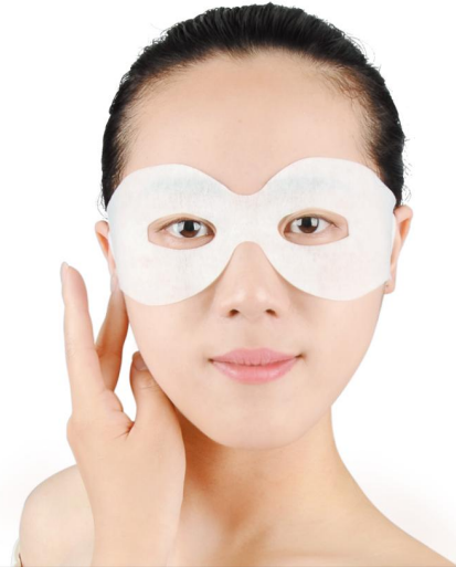
Ice eye mask (hanging from your ear)

Evenly lighten and lighten fine lines Skin-friendly, breathable, high purity and deep penetration Regulate your skin to make it elastic, tender and smooth