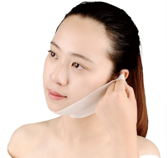
Ice chin mask (Hanging from your ears)

Improve the dullness of skin, double moist and bright Deep into the bottom of the skin, tender and elastic, replenish moisture for the skin Intensive nourishing, lock the essence, lasting moisture