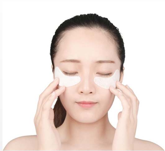
Cooling feels the eye mask

Choose soft close skin water gel material, cooperate with plant ingredient, laminating the nasal shape design, nonviolent tear of moderate effective adsorption impurities such as the black head on nose, and shrink pores, skin exquisite and smooth