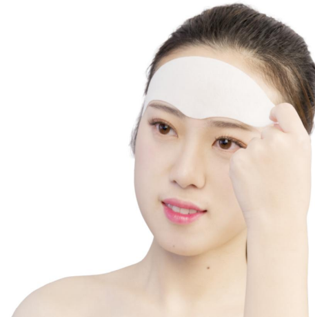
Ice forehead mask

Anti-wrinkle and firming skin eye mask, instantly refreshing, full of vitality, make the skin more soft and smooth, the fine lines between the eyebrows can also be improved on the black eye bags also have the effect of reducing, completely reliable, no irritating ingredients, suitable for any skin people to use, increase the degree of skin gloss