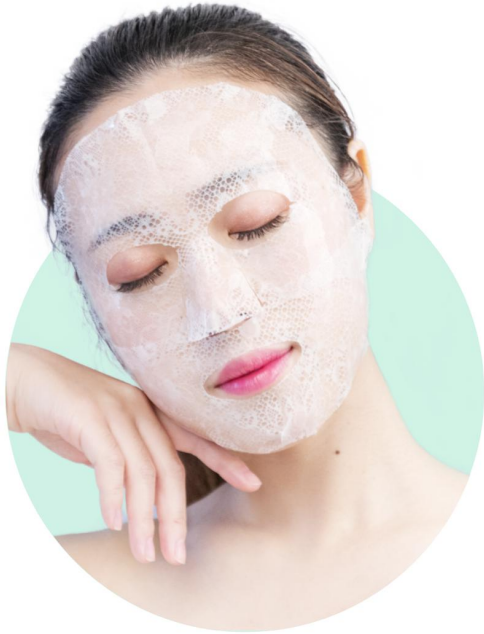
Ice crystal lace facial mask

Fashion design and skin care hydration perfect combination, the application of facial mask is also fashionable The lace material can fit the facial skin and infuse nutrition into the skin better The modelling of veil, satisfy the desire that becomes mysterious cool girl, show individual character ego completely