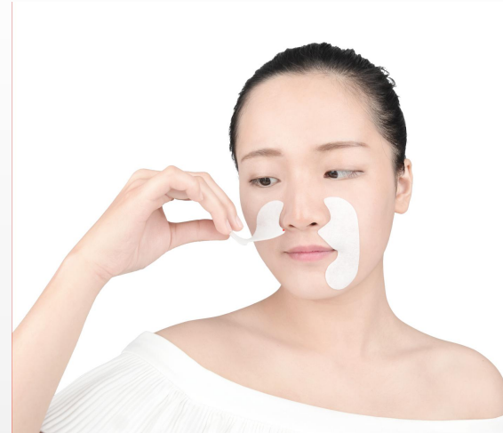
Cooling- Remover Nasolabial mask

Soft close skin water gel material, vegetal active points, relieve eye fatigue and solve the problem of all kinds of eye skin, eye bag, black rim of the eye, eye mask has direct and rapid improvement