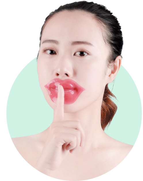
Ice crystals lip mask

Advantages: concentrated treatment of dry parts, remove eye bags, fade eye lines, dark circles, relieve eye fatigue, relieve amblyopia astigmatism and dry eyes Efficacy: water-rich seaweed extract, hydrogel material can provide sufficient hydration, concentrated hydration, with a strong skin lifting effect. Nine kinds of peptide components fill the wrinkles and creases of the eyes, making the skin of the eyes very elastic.