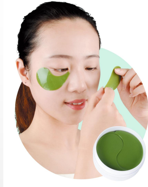
Ice crystals eye mask

Fade dark circles, brighten eyes, improve eye skin, vitality and luster Contains ceramide anti-wrinkle ingredients, let the skin elastic, moist, tight