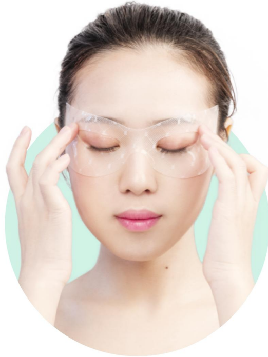
Ice crystal lace eye mask

Fashion design and skin care hydration perfect combination, the application of facial mask is also fashionable The lace material can fit the facial skin and infuse nutrition into the skin better The modelling of veil, satisfy the desire that becomes mysterious cool girl, show individual character ego completely