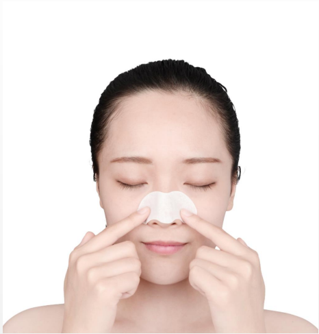
Cooling feels the nasal mask

Choose soft close skin water gel material, cooperate with plant ingredient, laminating the nasal shape design, nonviolent tear of moderate effective adsorption impurities such as the black head on nose, and shrink pores, skin exquisite and smooth