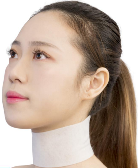
Ice neck mask

Evenly lighten and lighten fine lines Skin-friendly, breathable, high purity and deep penetration Regulate your skin to make it elastic, tender and smooth