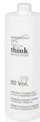
Bottle 150 ml e (20-30 V°) 1000 ml e (10-20-30-40 V°)