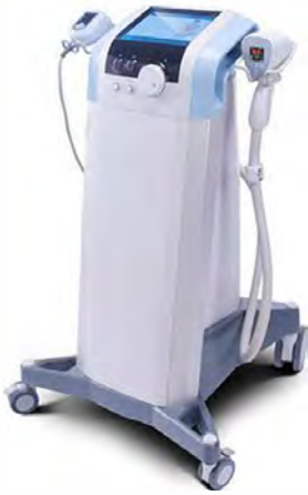
BTL EXILIS ELITE vertical type and portable type

The first and only device to simultaneously combine radio frequency and ultrasound to tighten skin and address body concerns. Advanced controlled cooling, allows delivery of heat to any layer, targets fat deposit, deep tissue and the top layer of the skin.